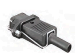
Retainer clip (included)