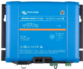
Smart IP43 Charger 12/50 (1+1)