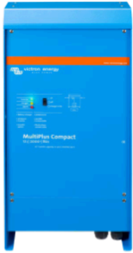
MultiPlus Compact 12/2000/80