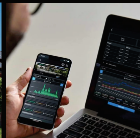
2-WAY CONSUMPTION MONITORING