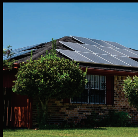
SOLAR PANELS MONITORING & CONTROL